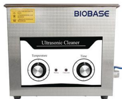
UC-18J/UC-24J/ UC-36J/UC-48J/ UC-60J