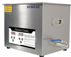
UC-18D/UC-24D/ UC-36D/UC-48D/ UC-60D